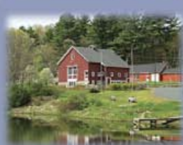
River Bend Farm Visitor Center

Samuel Slater started it, his br... The development of the mill vi... Valley, the mill village is a signi... and down the Blackstone River