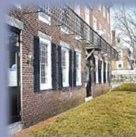
Mill Housing and Company Store in Rogerson's Village

• Rogers... An exce... village s... Crown &