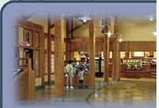
295 Visitor Center