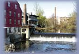
Red Brick Mill & Dam