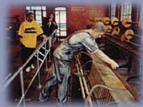
Museum of Work & Culture